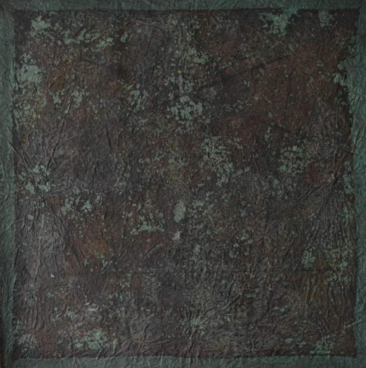
Dragon Carpet / Enneagram Mixed Media on Canvas 182x182 cm