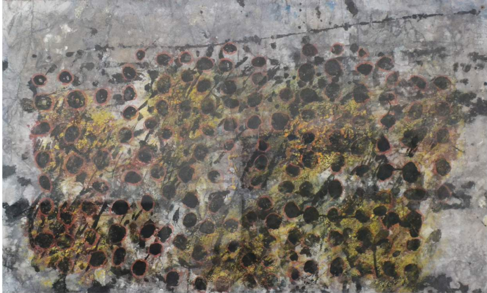
Leopard Mixed technique on paper 60x40 cm