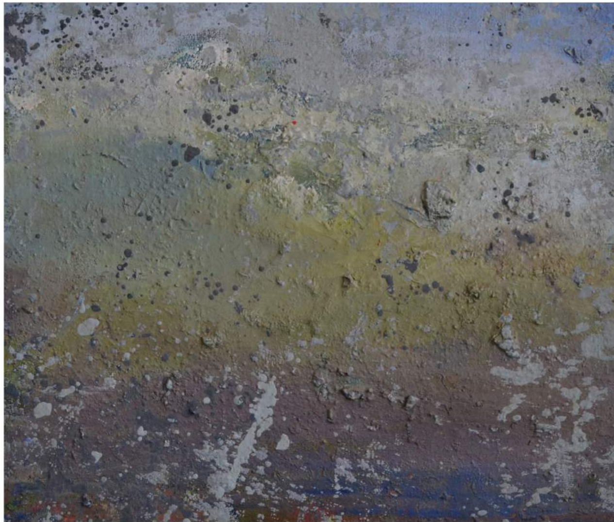
Aragats oil on canvas 45x53 cm