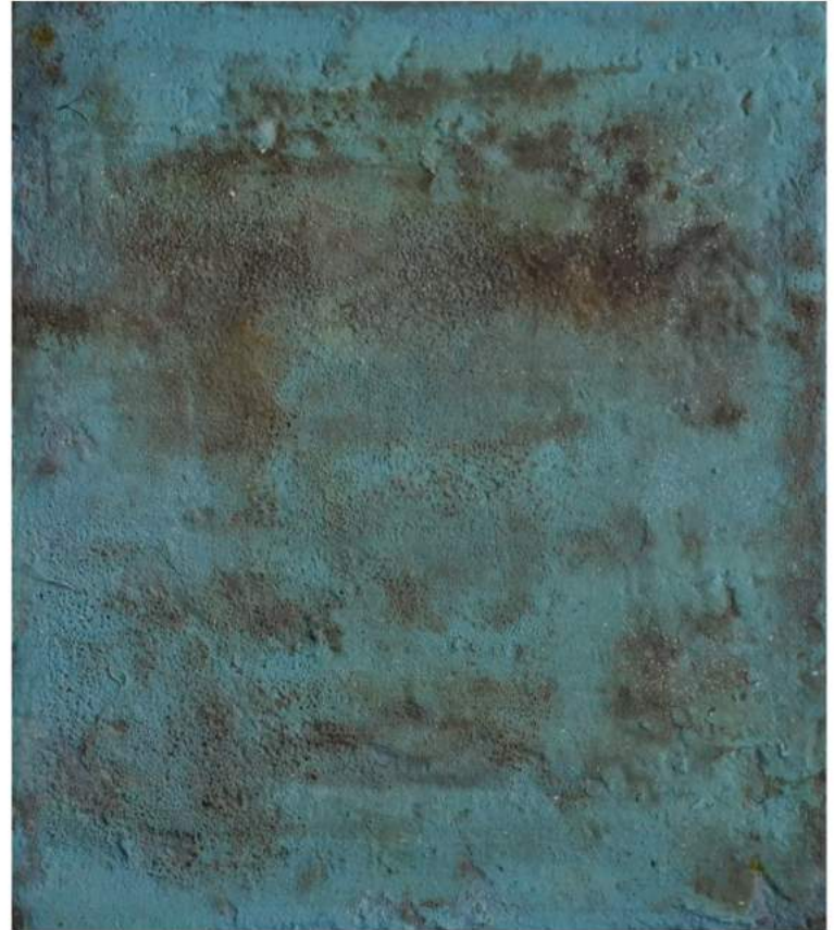
“Night of light” series/ Kutahya mixed technique 44x51cm